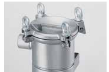
Ergonomic, integral cover handle is easy to open and close