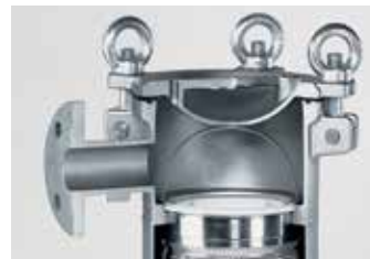
Compression bag hold down creates 360 degree sealing between filter bag and bag filter housing