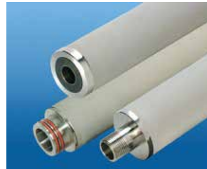
LOFMET filter cartridges are available with a variety of gasket and end cap configurations.

The micron ratings shown at various efficiency and beta ratio value levels were determined through laboratory testing, and can be used as a guide for selecting cartridges and estimating their performance. Under actual field conditions, results may vary somewhat from the values shown due to the variability of filtration parameters. Testing was conducted using the single-pass test method, water at 3 gpm/10" cartridge (9.45 l/min). Contaminants included latex beads, coarse and fine test dust. Removal efficiencies were determined using dual laser source particle counters.