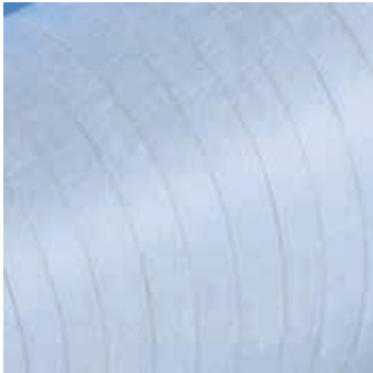
Endless fiber structure limits fiber migration at a bare minimum