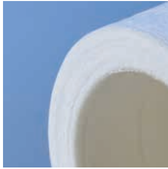
Graded media structure yields gradual loading