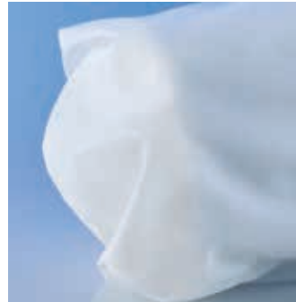
Optional polyamide 6.6 mesh cover in 10 µm forms a protective outer shield