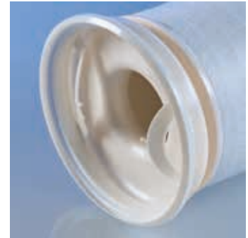
Bypass-free sealing through SENTINEL seal ring