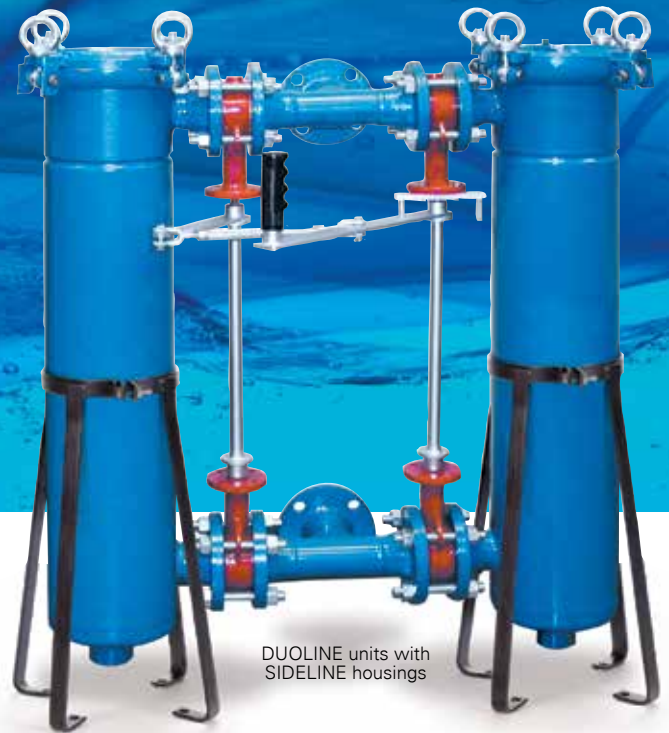
DUOLINE units with SIDELINE housings

Eaton's DUOLINE multi-bag filter housing systems are duplex units for continuous filtration processes where the system flow cannot be shut down for filter bag change-outs.